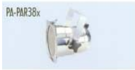
Socket: Medium Screw-in E27 Weight: 1.5 Lbs.