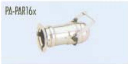
Socket: Intermediate Screw in E17 Weight: .45 Lb.