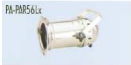
Socket: Mogul End Prong GX16d Weight: 4 Lbs.