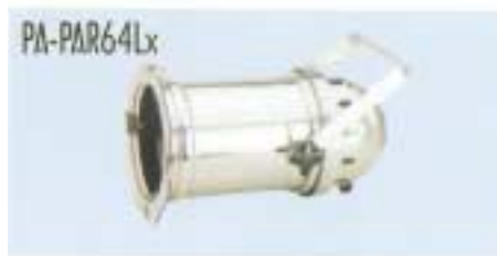
Socket: Mogul End Prong GX16d Weight: 4.5 Lbs.

Copyright © 2000 Techni-Lux, Inc. All rights reserved. Printed in the U.S.A. All weights include power cords and do not include lamps/bulbs. All Par-Cans have octagonal gel frames. The "x" denotes finish of Par-Cans either polished or black except for PA-PAR20 which also comes in white. Specifications are subject to change without notice.