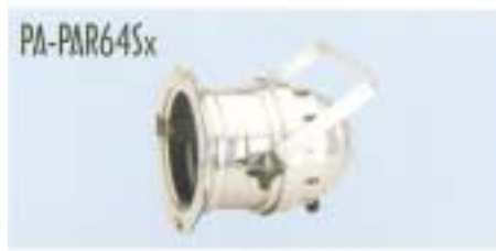
Socket: Mogul End Prong GX16d Weight: 3.8 Lbs.