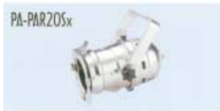
Socket: Medium Screw-in E27 Weight: .8 Lb.