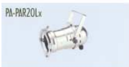
Socket: Medium Screw-in E27 Weight: .9 Lb.