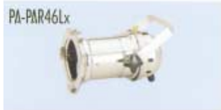
Socket: Medium Sized Prong MSP Weight: 3.5 Lbs.