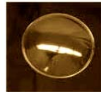
Very Narrow Lens